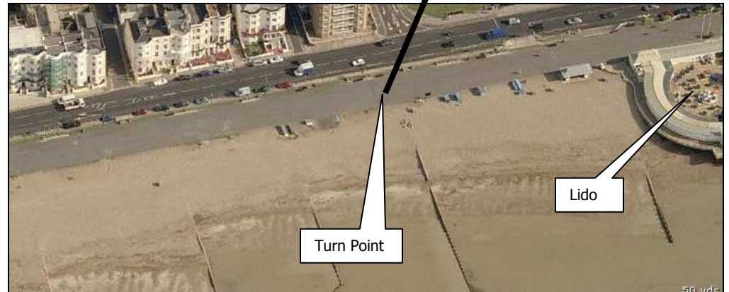
Turn Point 1 (Water)