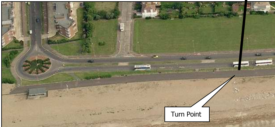
Turn Point 2 (Collect Wrist Band)